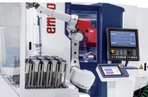
Compact, flexible all-in-one solution: Hyperturn 45 G3 with Turn-Assist

More compact and more user-friendly than comparable solutions – characteristics that best describe the Turn/Mill-Assist for loading and unloading EMCO turning or milling machines. Depending on your range of parts and batch sizes, you can choose from among several models.